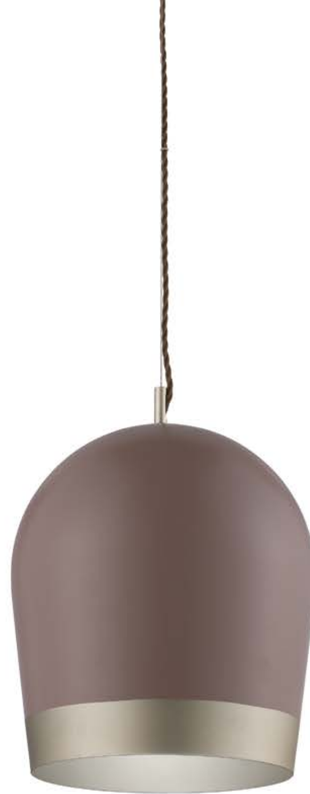
dove gray & gold