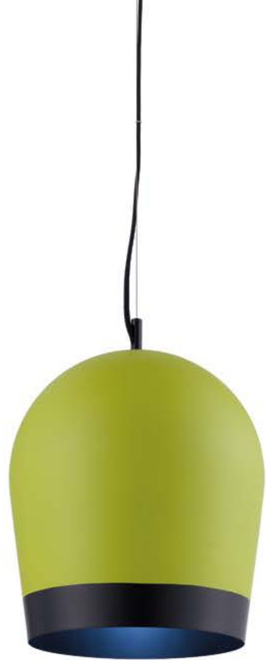
lime green & black