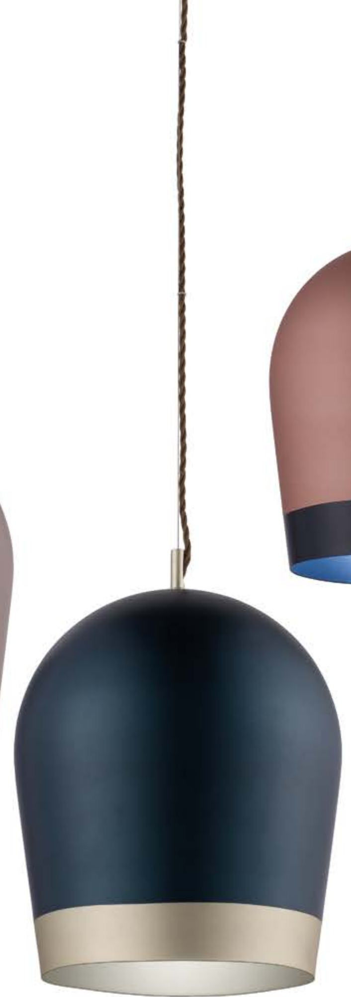
petrol green & gold