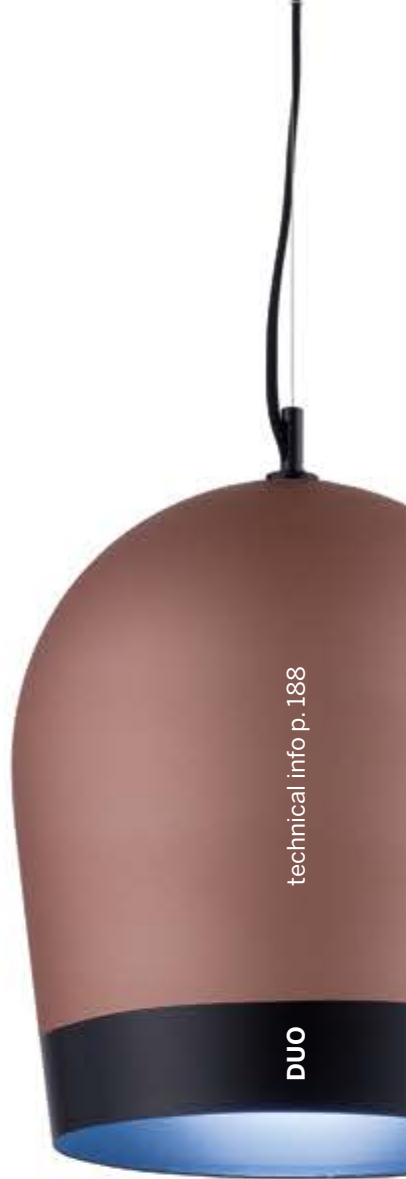
copper & black