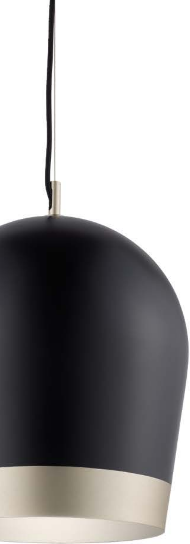
black & gold